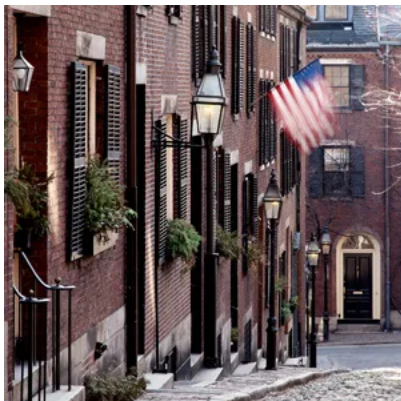
Historic downtown Boston

"USETDA 2012: A revolution in scholarship – A commonwealth of knowledge" –